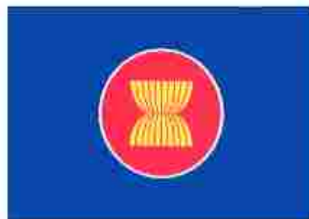
The ASEAN Flag

Let's Do It Locate the ASEAN members on the map. Find the location of the ASEAN Secretariat.