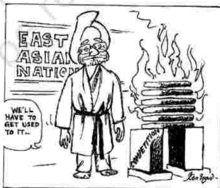
Kashav, The Hindu

India's 'Look East' Policy since the early 1990s and 'Act East' Policy since 2014 have led to greater economic interaction with the East Asian nations (ASEAN, China, Japan and South Korea).