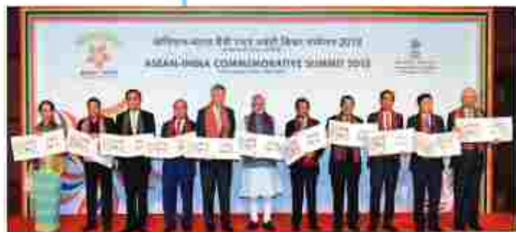
Leaders release postal stamps to commemorate silver jubilee of India and ASEAN partnership in New Delhi on 25 January 2018

Thailand. The ASEAN-India FTA came into effect in 2010. ASEAN's strength, however, lies in its policies of interaction and consultation with member states, with dialogue partners, and with other non-regional organisations. It is the only regional association in Asia that provides a political forum where Asian countries and the major powers can discuss political and security concerns.