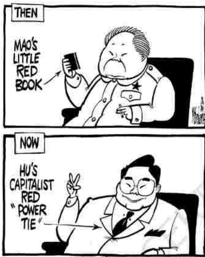
China then and now