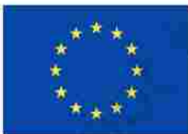
The European Union Flag

The European Union has evolved over time from an economic union to an increasingly political one. The EU has started to act more as a nation state. While the attempts to have a Constitution for the EU have failed, it has its own flag, anthem, founding date, and currency. It also has some form of a common foreign and security policy in its dealings with other nations. The European Union has tried to expand areas of cooperation while acquiring new