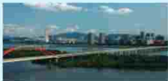
Skyline of Seoul city near the Han River

The South Korean brands such as Samsung, LG and Hyundai have become renowned in India. Numerous agreements between India and South Korea signify their growing commercial and cultural ties. Find out about major agreements signed in the recent past.